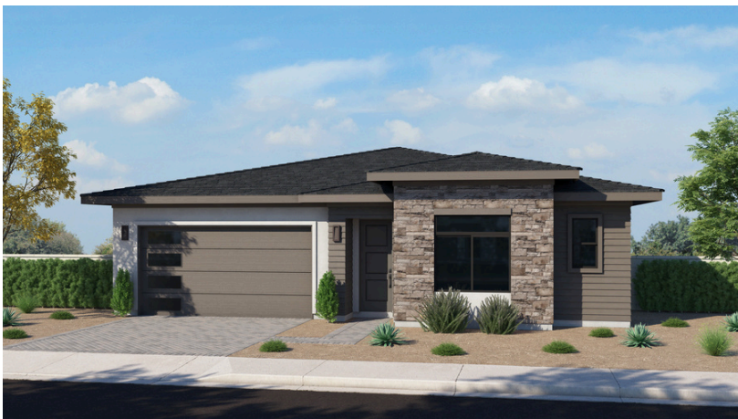
MODERN PRAIRIE ELEVATION

Renderings are conceptual and may show optional features. Plans, specs, features and community info subject to change without notice. All dimensions and square footage are approximate. Offered for sale by Valley Peaks Realty Arizona Broker # BR679355000 LIC # LC638308005 ROC #349994. 03.23.26