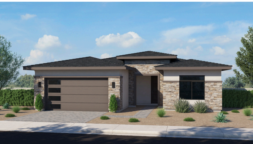
MODERN PRAIRIE ELEVATION

Renderings are conceptual and may show optional features. Plans, specs, features and community info subject to change without notice. All dimensions and square footage are approximate. Offered for sale by Valley Peaks Realty Arizona Broker # BR679355000 LIC # LC638308005 ROC #349994. 03.23.26