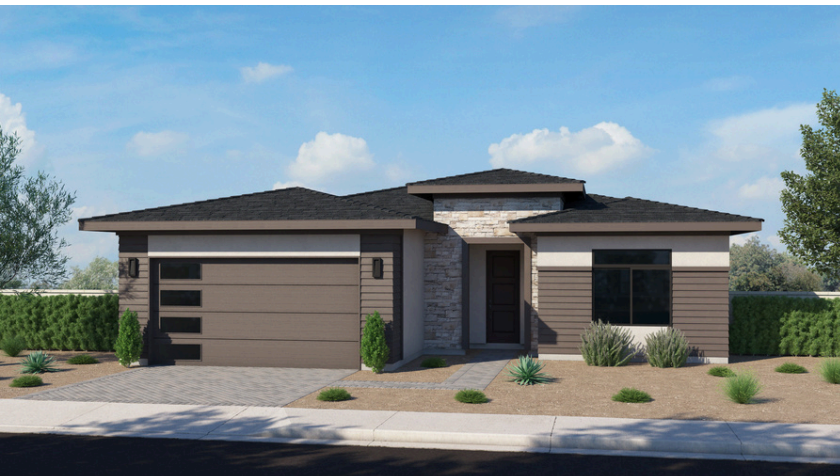
MODERN PRAIRIE ELEVATION

Renderings are conceptual and may show optional features. Plans, specs, features and community info subject to change without notice. All dimensions and square footage are approximate. Offered for sale by Valley Peaks Realty Arizona Broker # BR679355000 LIC # LC638308005 ROC #349994. 03.23.06