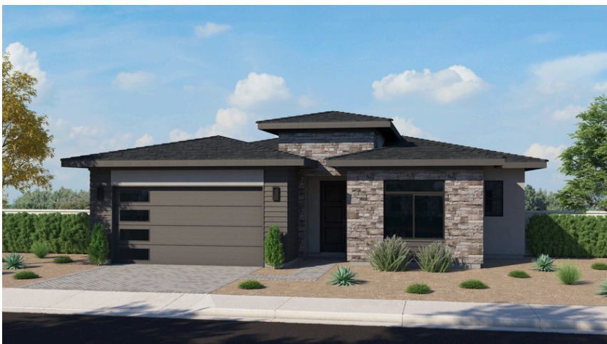
MODERN PRAIRIE ELEVATION

Renderings are conceptual and may show optional features. Plans, specs, features and community info subject to change without notice. All dimensions and square footage are approximate. Offered for sale by Valley Peaks Realty Arizona Broker # BR679355000 LIC # LC638308005 ROC #349994. 03.23.26